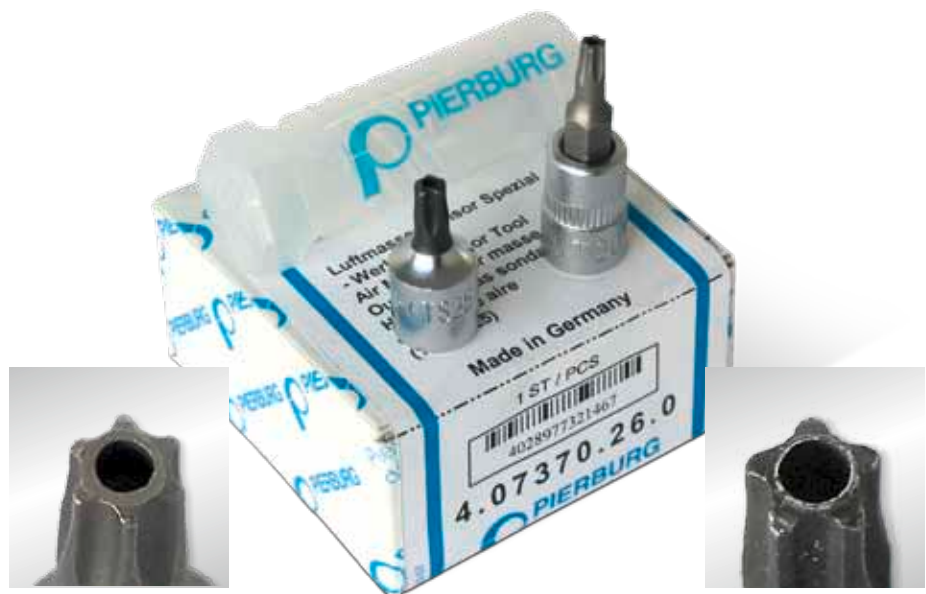
Insert bit T 20 (6 star pattern, Torx®) with face bore

The two tools are 1/4-in. insert bits of proven MSI quality which will fit all commercially available 1/4-in. ratchets or socket wrenches.